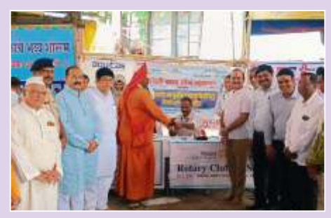
05 Oct. to 12 Oct. - Navratri Niramay Diabetes Camp near Rupabhawani Temple