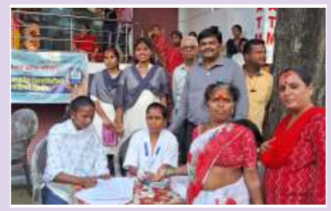
08 Oct. - Danka Mahotsav Diabetes Camp