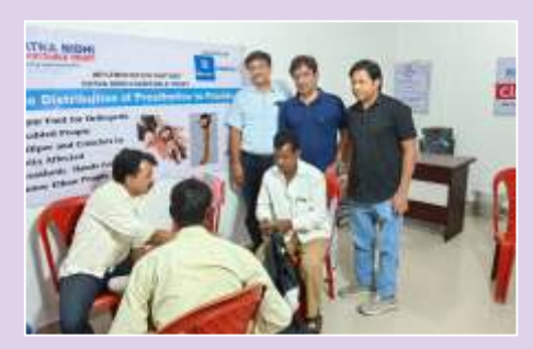
26 and 27 Oct. - Jaipur Foot Camp