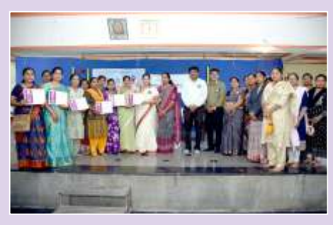
19 Oct. - RYLA on Girl Safety at SVCS School