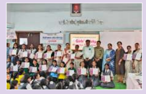
19 Oct. - RYLA on Girl Safety at S. R. Chandak School